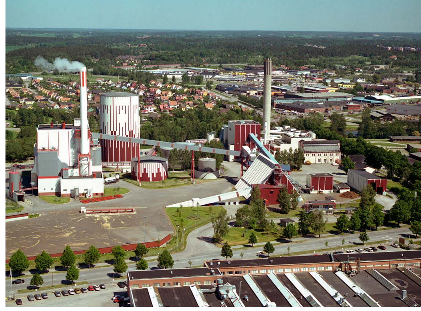
The local energy system of Eskilstuna has been modelled to estimate the long-term cost-efficient flexibility potential.

losses of 24%. For Lower Austria, the task included data collection, assessment of current status, and upscaling DSM potentials obtained in the demo site. Accordingly, the maximum DSM potential for demand shifting was estimated at around 5% of the heating load.