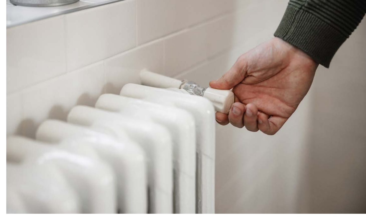
Control over temperature is desirable to residents.

3.14 approach. Additionally, an analysis of the EU and national policy framework was conducted, and barriers were derived to validate the developed business models.