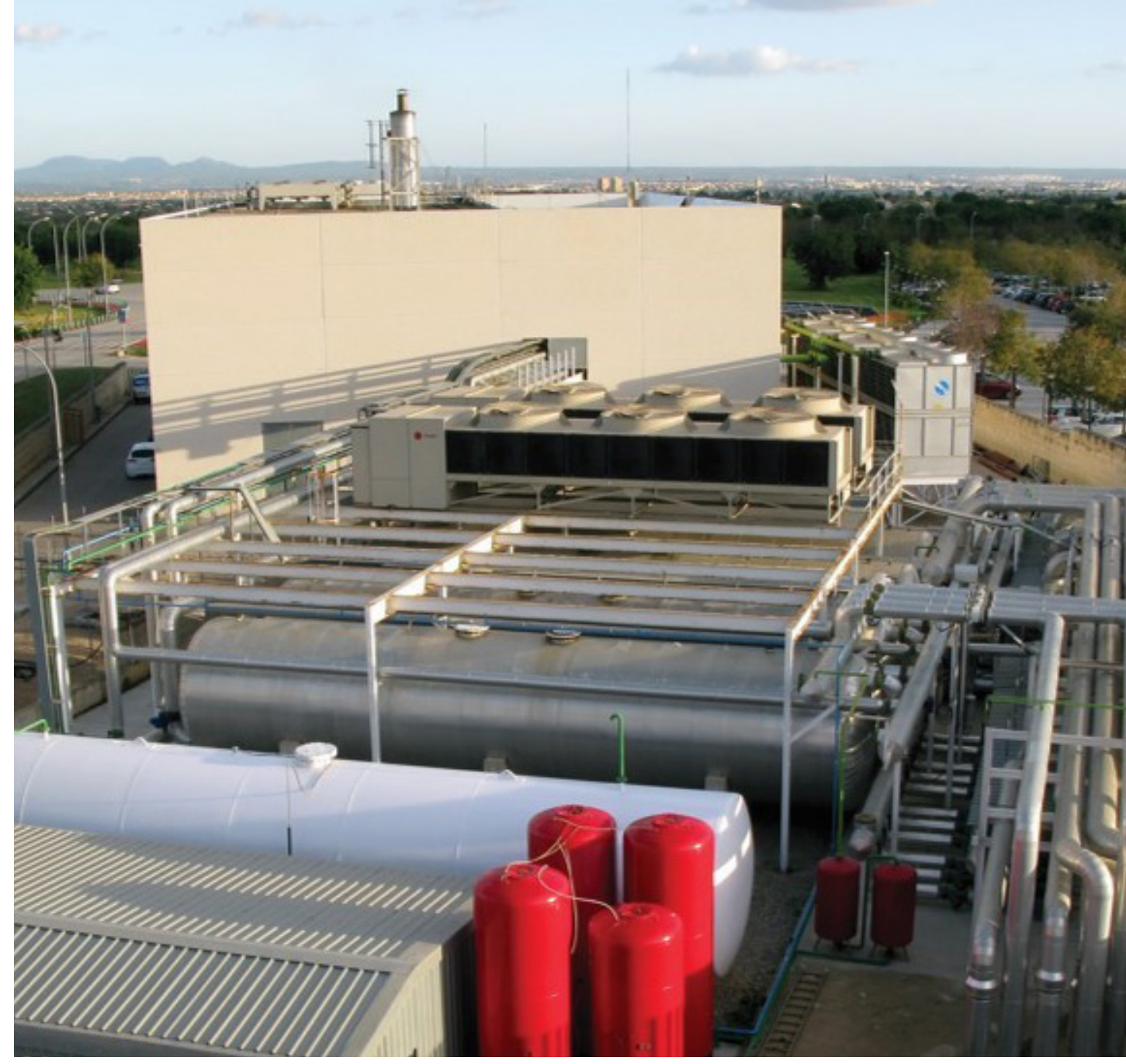
Parc Bit has an advanced tri-generation plant that supplies the area with heating, cooling and electricity.

there are many factors which might influence the results. Further studies are required to obtain actual gains from grid flexibility.