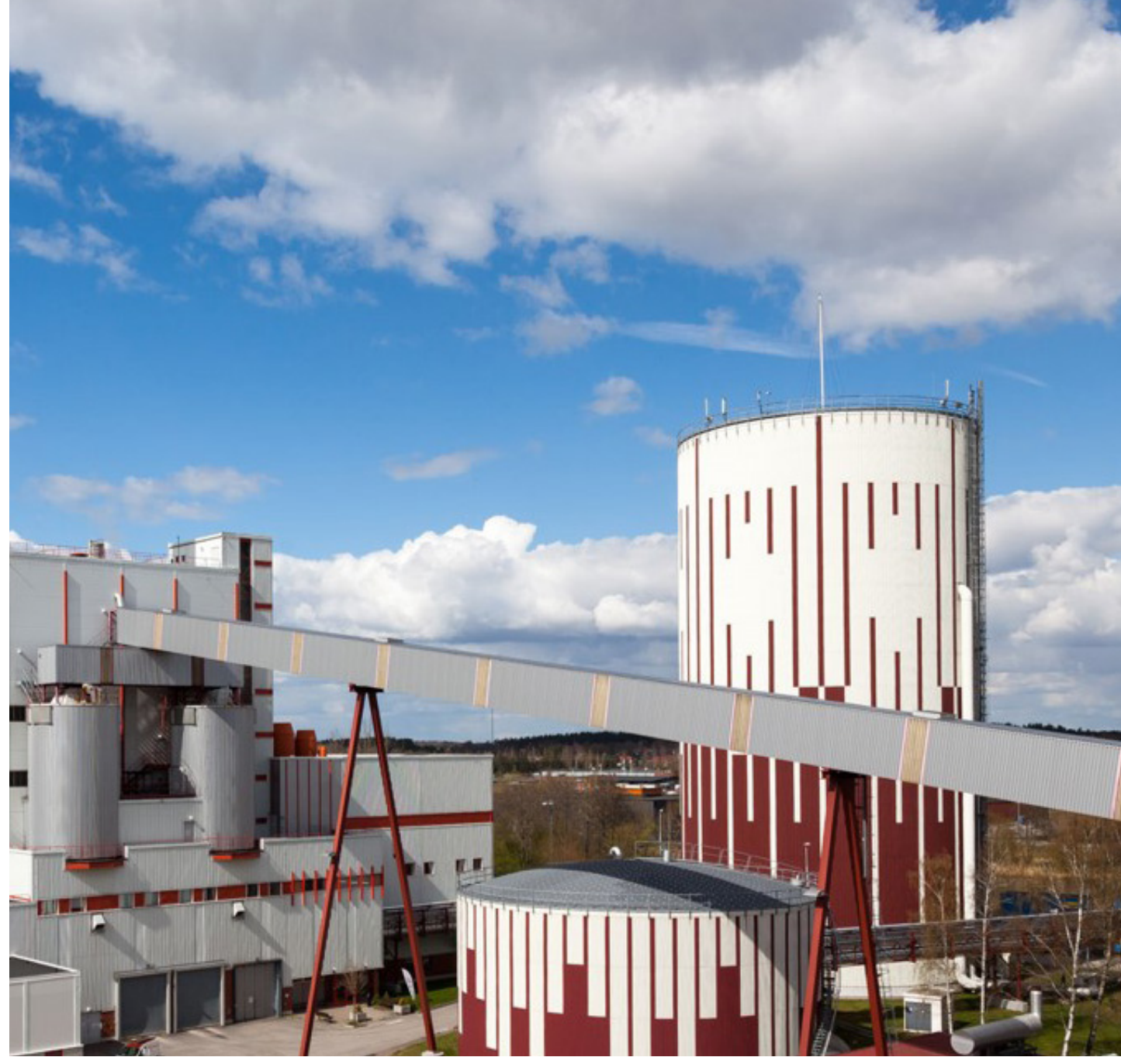
Eskilstuna's district heating plant with the characteristic white and red colours.

discussions in Sweden on the possibilities of using different kinds of demand-side flexibility, he explains. Still, so far, mainly the prominent players in the district energy market in Sweden have experimented with demand side flexibility. Flexi-Sync has given smaller players the resources to participate in the development of the future district energy landscape. As the district heating grid in Eskilstuna is representative of the systems in many mid-sized Swedish towns, the Flexi-Sync experiences could also benefit other regions