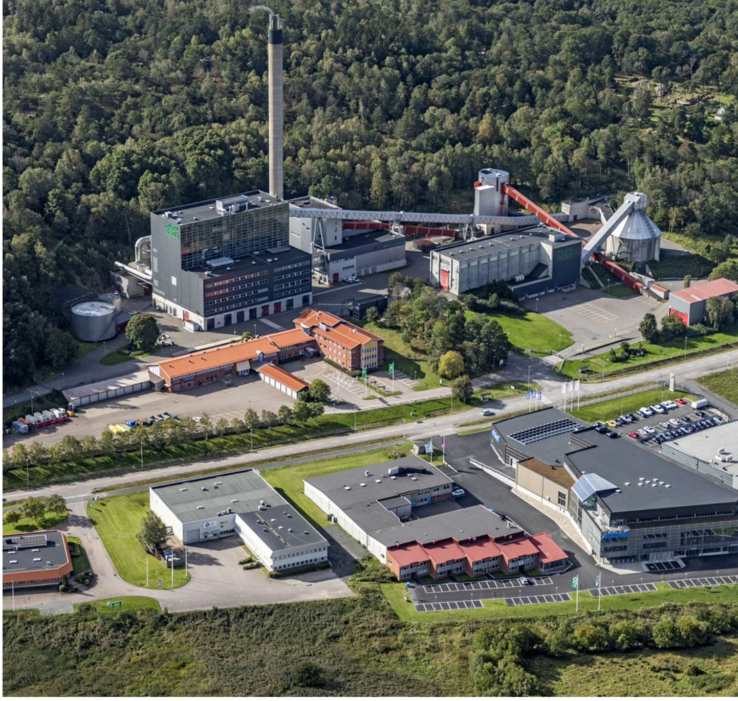
The district heating plant of Mölndal produces 290 GWh of heat each year.

believes that the company will use the technology more in the future. Their buildings are moving away from being a sole consumer of energy. As a housing company they are becoming more of an integrated part of the urban energy system, and the Flexi-Sync concept could be a first step in the right direction