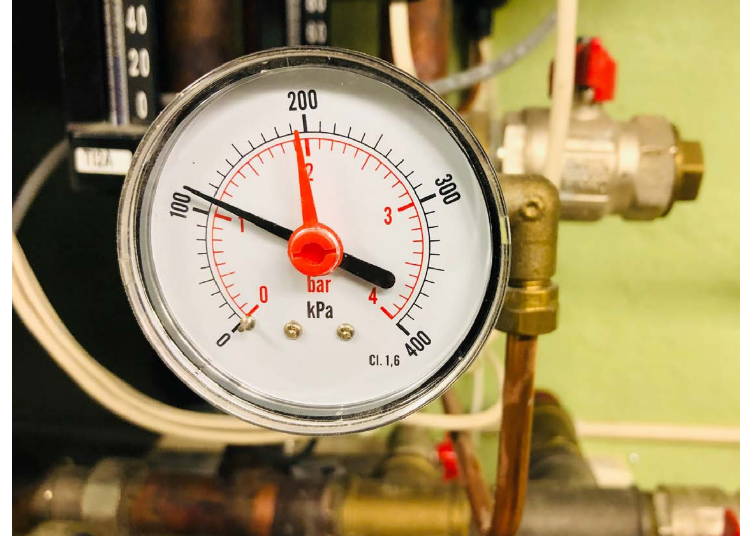
Flexibility was explored from an optimisation and automatic control point of view.