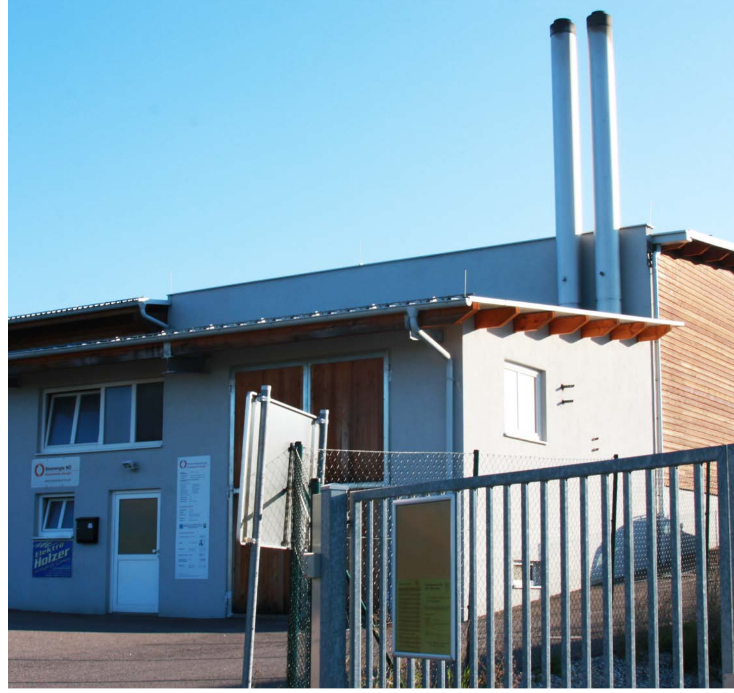
The district heating plant of Maria Laach is the smallest in the project and located in a rural area.

grids like Maria Laach. Hence, finding a low-cost solution, e.g., automating the optimisation process to reduce operational costs is necessary. Another solution would be to combine several small- and midsized heat plants to spread the costs for optimisation measures. In the future, with a combined heat and power plant in Maria Laach, excess electricity could also be used for load compensation and stabilising the power grid.