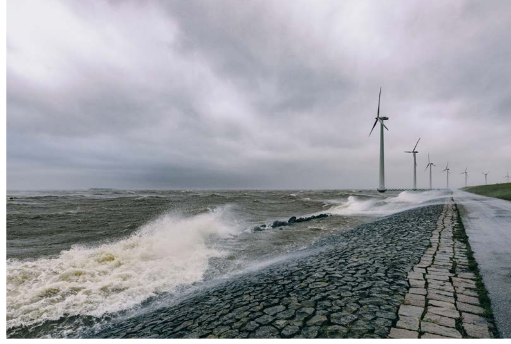
Climate change can induce unprecedented weather extremes and variations that need to be considered in the design of energy systems.

In public debate there is much focus on how the transition to a renewable energy system is one of the keys to tackle climate change. Less is being said about the impact of climate change on the energy particular system, and in energy demand and renewable generation. The fact is that climate change can affect both energy demand and renewable generation. This becomes challenging for the sustainable energy transition of societies, especially due to extreme climate events and weather variations. Climate change can induce unprecedented weather