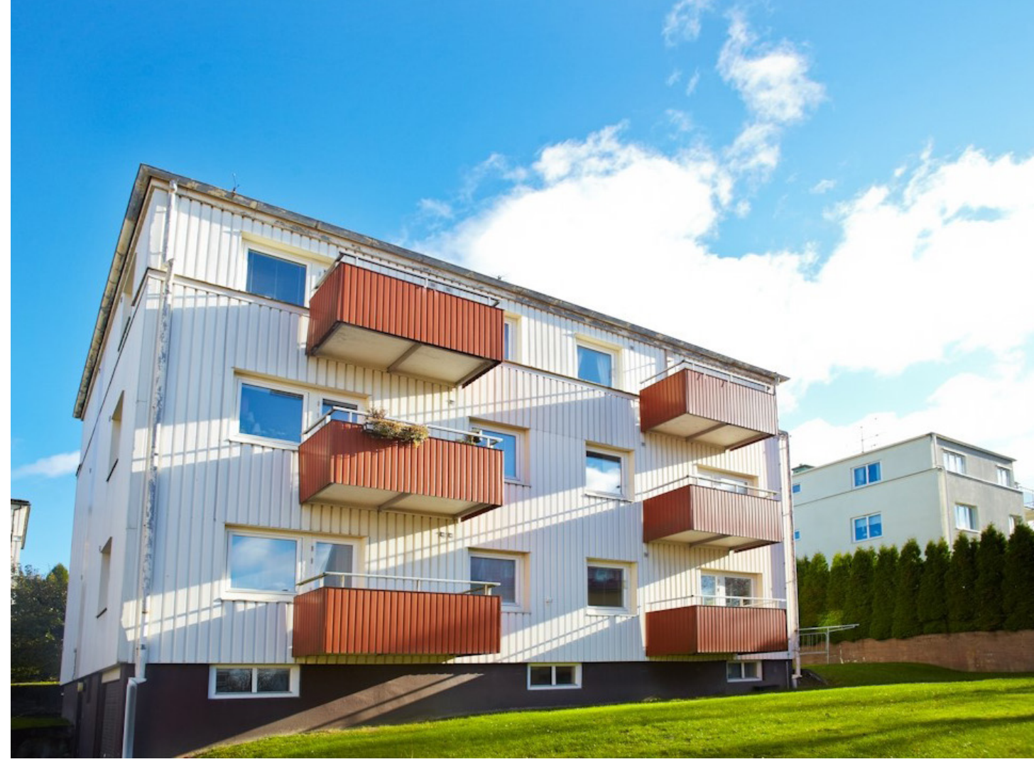
One of the houses in Borås where the solutions have been tested.

and days has been sent from the NODA system. These forecasts have been utilised in the system optimisation in the Utilifeed platform. The optimised flexibility plan has then been sent back to NODA, which has executed the plan while at the same time guaranteeing the indoor climate in the buildings providing flexibility.