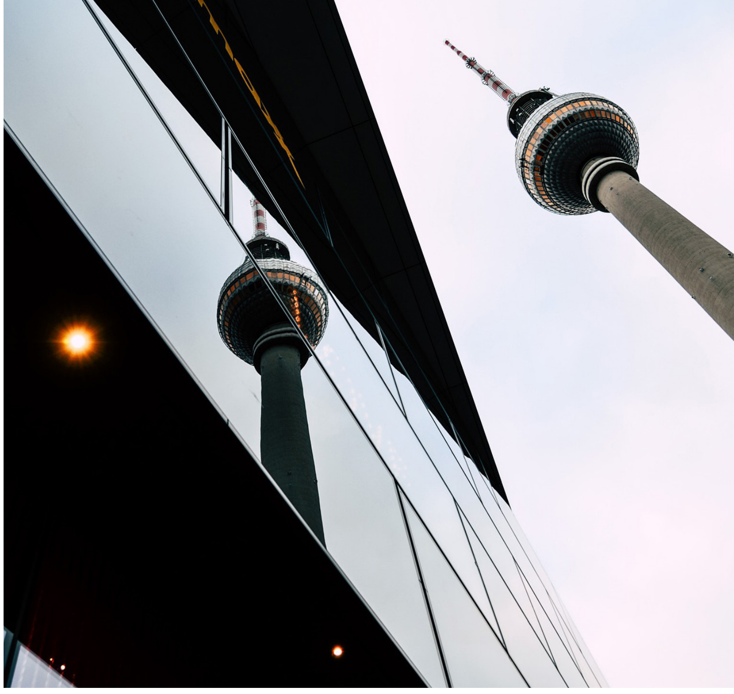
Grüne Aue, the German demo site, is located in the city of Berlin.

cooling process heat is recovered and fed into the district heating system, leading to a more careful use of the primary energy resources and the reduction of urban hotspots in Berlin. In addition, no re-cooler needs to be set up at the customer's facility, meaning that space is freed up for other purposes. The German Property Federation ZIA awarded this concept an "Outstanding innovation 2021"