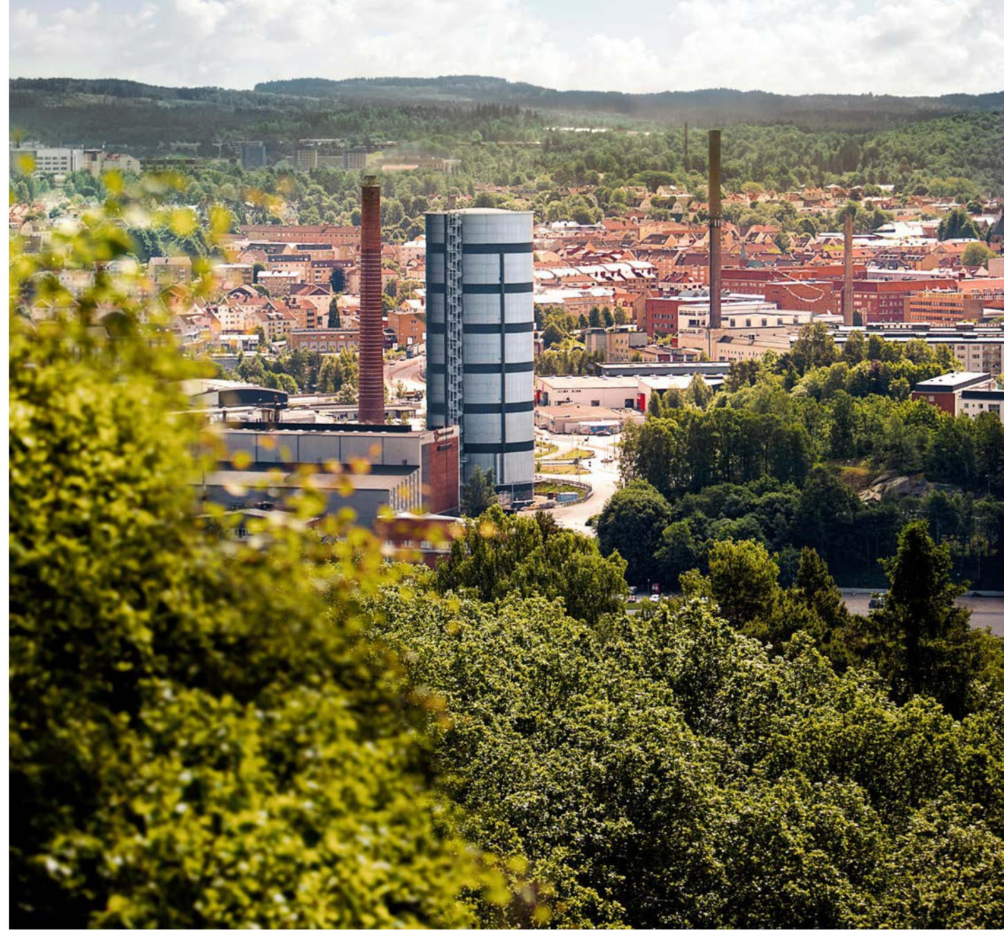
The thermal heat storage connected to the district heating grid of Borås is visible all over town.

especially for commercial housing companies such as Willhem. Since heating is included in the rent in most of Sweden's multi-family residential buildings, there are no existing incentives for the tenants to accept any discomfort or variation in their indoor climate today. If we can create this incentive for our customers and allow more significant variations in temperature, the effect of this kind of functionality can probably be higher, Magnus Åkerskog concludes