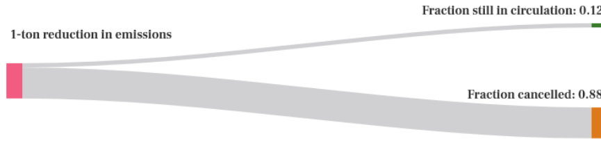
Figure 1. Outcomes in 2030 of a 1-marginal-ton reduction in 2018