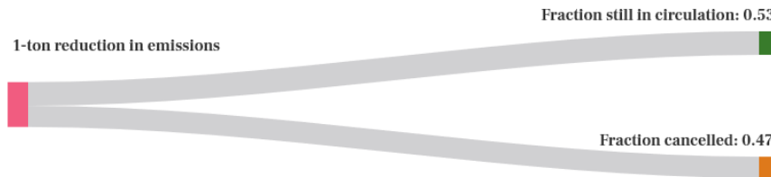
Figure 2. Outcomes in 2030 of a 1-marginal-ton reduction in 2024